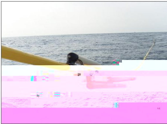
Streamer & Bird installed in R/V TAMHAE II