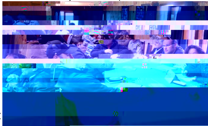
Training workshop on the Transparency and Access to Public