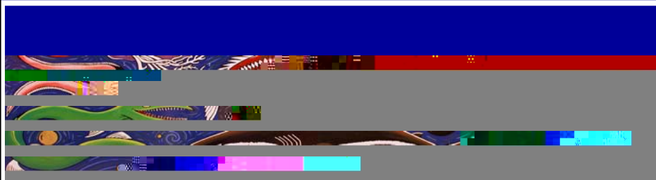
"Deep Sea Food Chain", Mural Painting by Bruce Mahalski, New Zealand

8 th Meeting of the United Nations Open-ended Informal Consultative Process on Oceans and the Law of the Sea (25-29 July 2007)