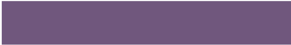
Table D Fuel-exporting countries