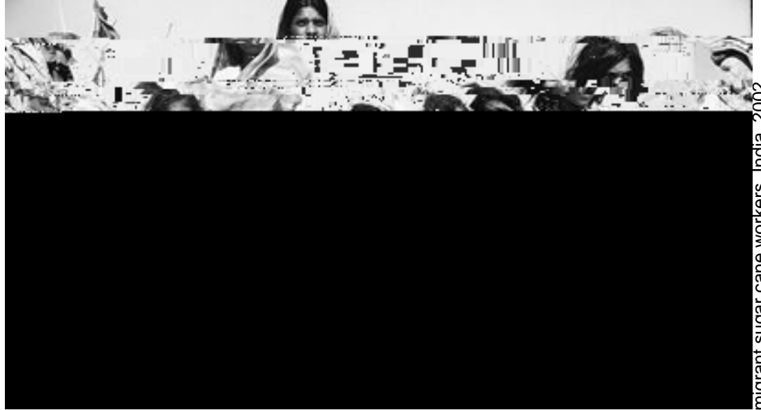
migrant sugar cane workers, India 2002