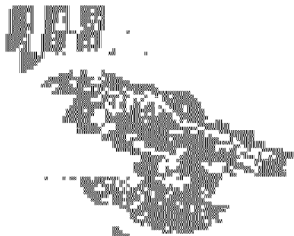
CHART AGAINST DELIVERY.