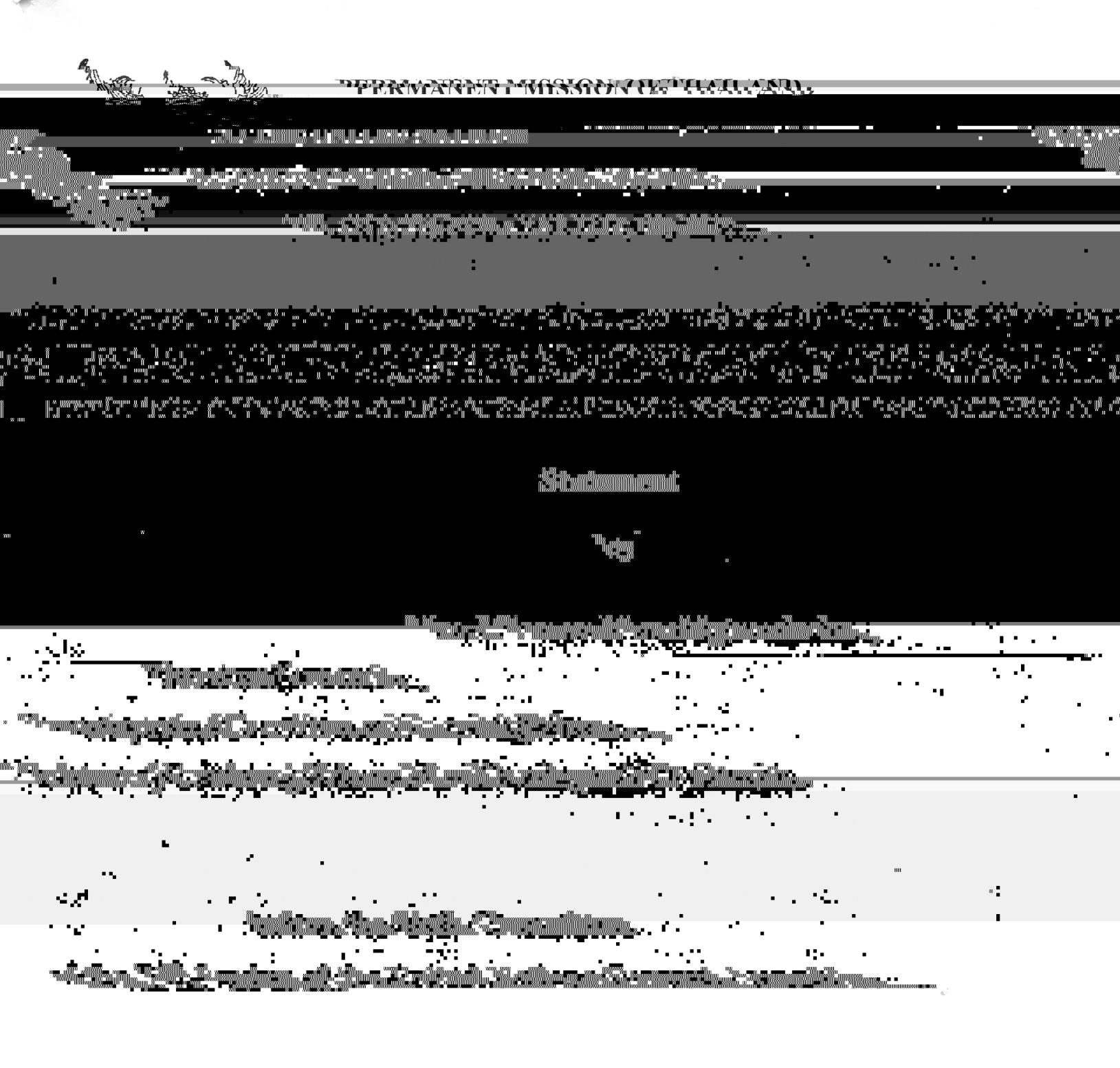
Agenda Item 79.