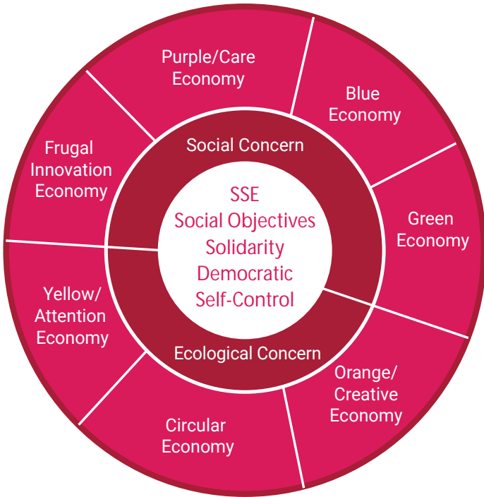
How SSE relates to the other NESD concepts