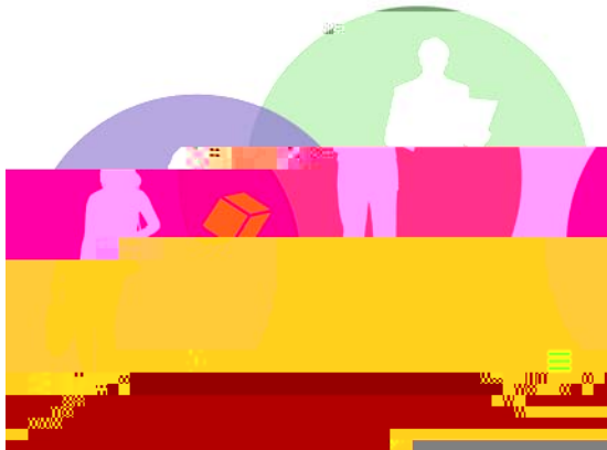
Figure 7. Enacting gender roles

may be shifting cultural norms as to which gender is supposed to operate a lawn mower, but there can also be specifically negotiated arrangements on this issue within a group of people or between a man and a woman in a household. An example of a rigid cultural norm, on the other hand, is the ban on women's driving.