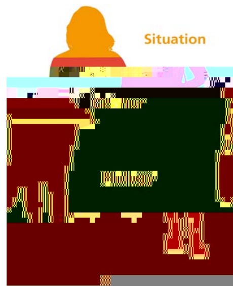
Figure 6. Gender factors influence observed behavior in specific situations

Converting this insight into practical guidelines for designing products means that in order to be able to navigate gender you need to investigate cultural gender norms (which can vary depending on region and/or sub-culture) and you need to map situative aspects of use concerning the product you design. The user knowledge gained through the combination of expert knowledge and specific user studies will help the developers identify specific gender factors to be considered in the design of a product.