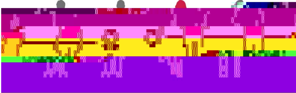
Figure 5. Gender is a continuum

The differences described above present extreme traits of each gender. We find it relevant to present gender as a continuum with the clearly female and clearly male traits on each opposite side, and the unisex in the middle. The position of individuals on this scale will vary.